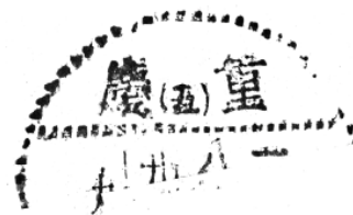
Figure 6 Chungking 1951.8.31 (this cancel under the slip)