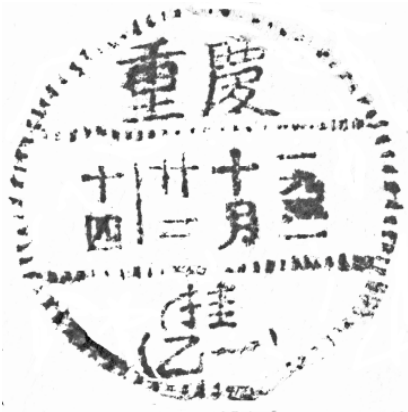
Figure 7 Chungking, Registered section