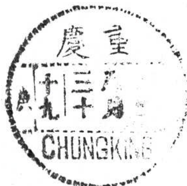
Figure 5 Chungking 1951.8.30